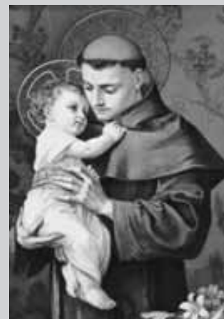
St. Anthony of Padua