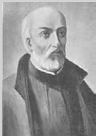
St. John de Brebeuf